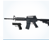
FIREARMS (MILT / COMM)