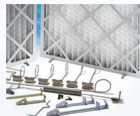
AIR FILTER HOLDING FRAME HARDWARE