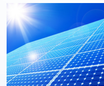
SOLAR INDUSTRY COMPONENTS